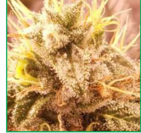
*Actual pictures from cultivation